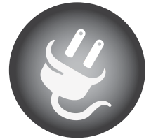
Plug 120V (convertible 240V)