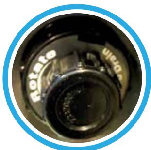
External drain valve

Image for reference only. Colors, specifications and location of the whirlpool* jet may vary (optional).