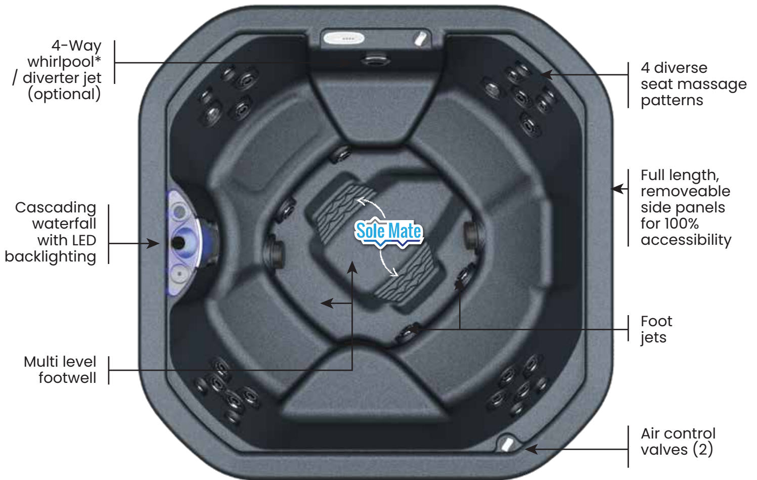
Image for reference only. Colors, specifications and location of the whirlpool* jet may vary (optional).