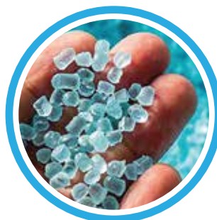
One-piece polyethylene construction