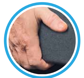
Integrated transport handles