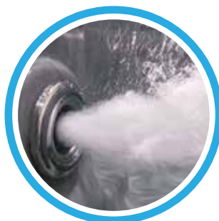
Intense whirlpool* jet action